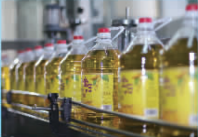
中纺威品油 CHINATEX PRODUCT OIL