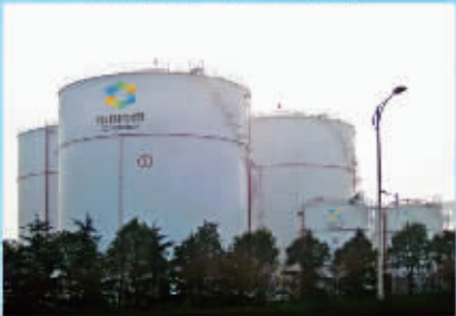
中纺粮油厂有限公司 CHINATEX GRAINS & OILS PROCESSING CORPORATION