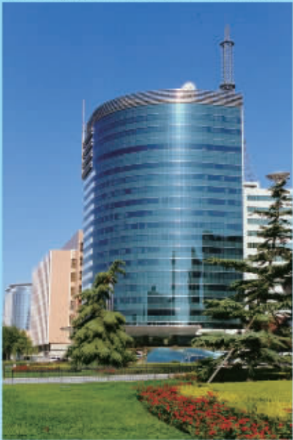
中纺大厦 CHINATEX MANSION

中国中纺集团公司（以下简称公司）创建于1951年，是国务院国有资产监督管理委员会（以下简称国资委）下属的大型企业集团，是国资委批准建立规范董事会制度的中央企业，中国五百强企业。